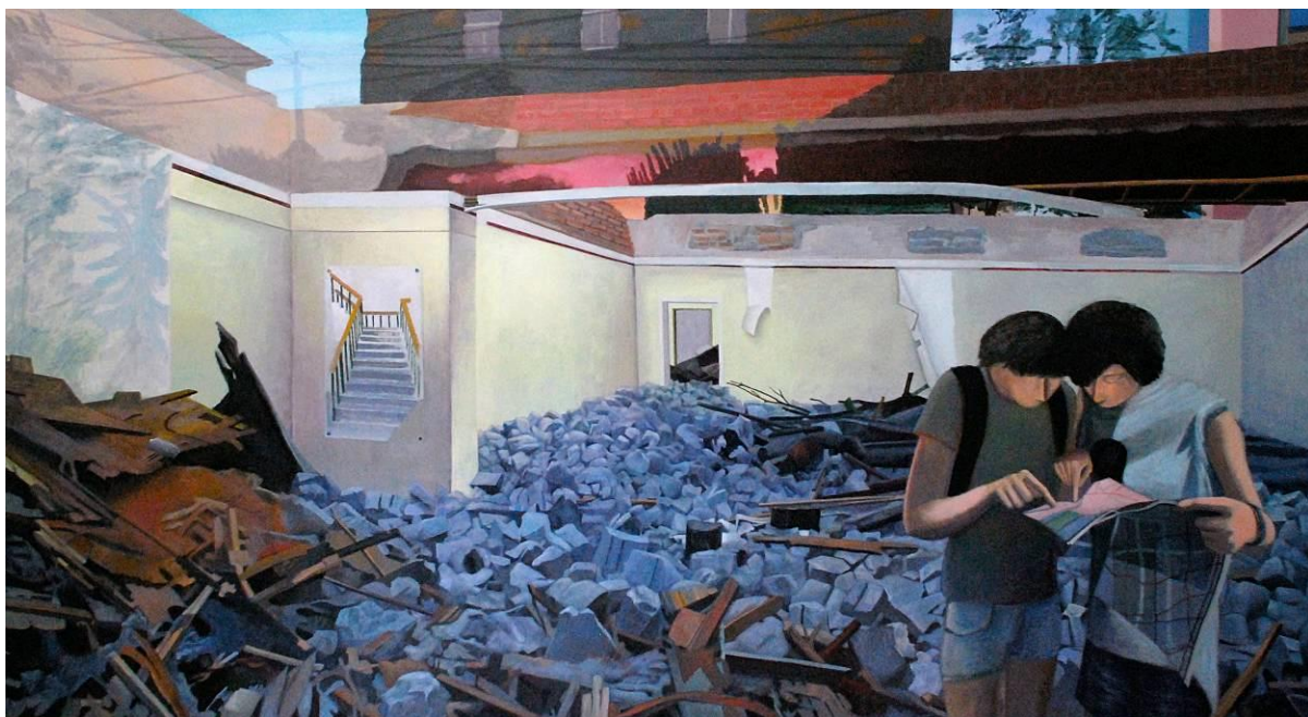
看地图 Read the Map 2012