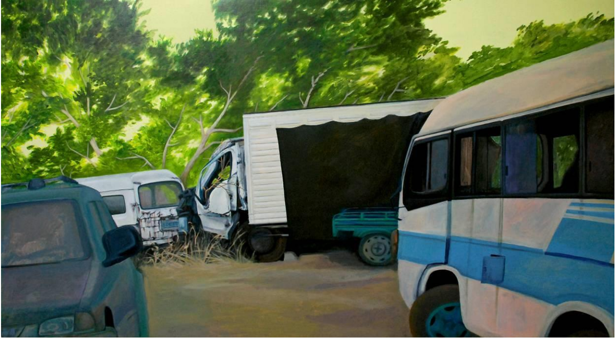
漫长的告别 The Long Goodbye 2012