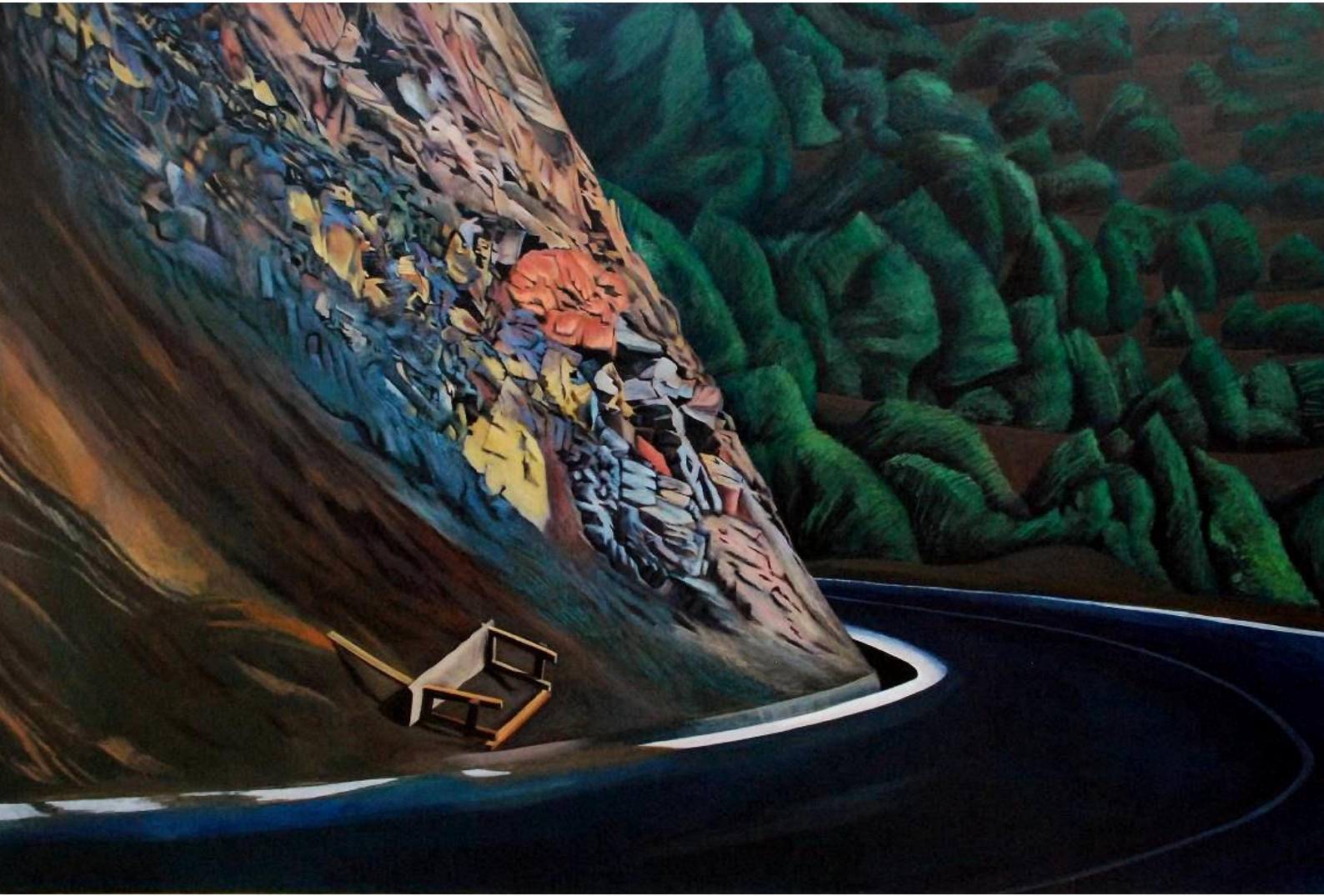
悬搁 Suspension 2013