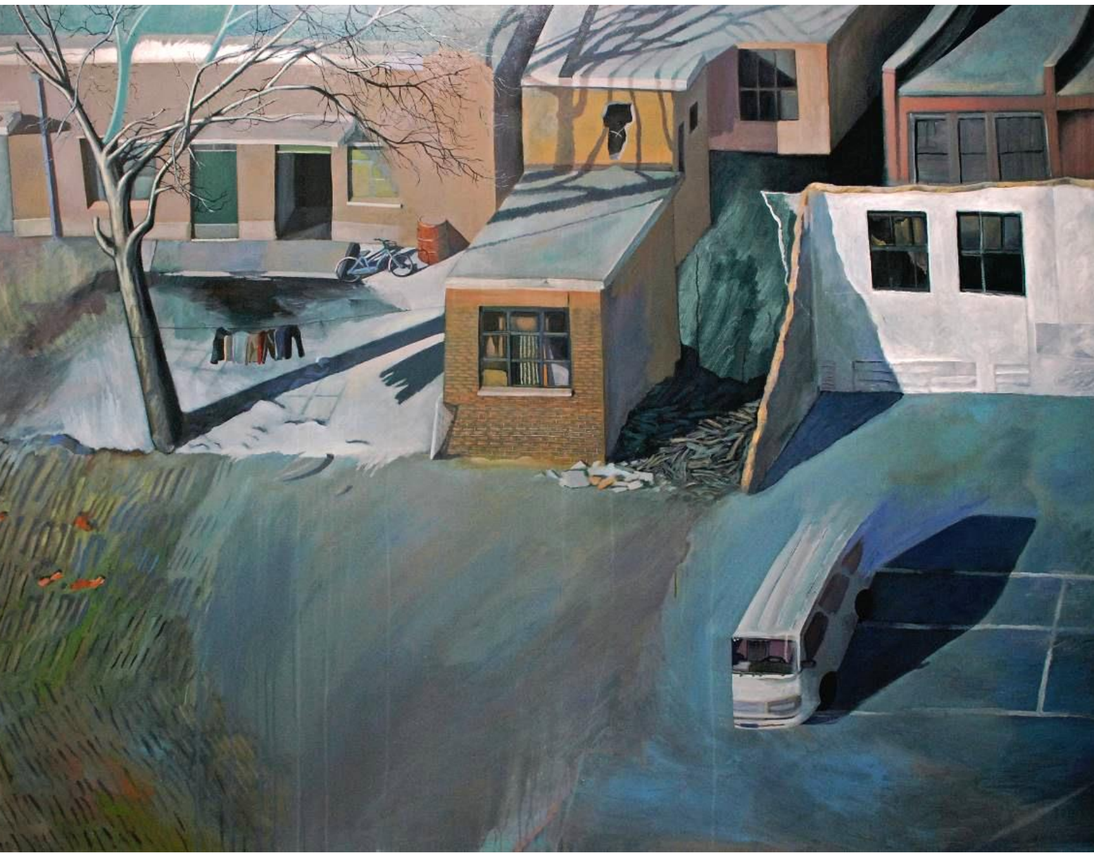
慢 Slow 2011