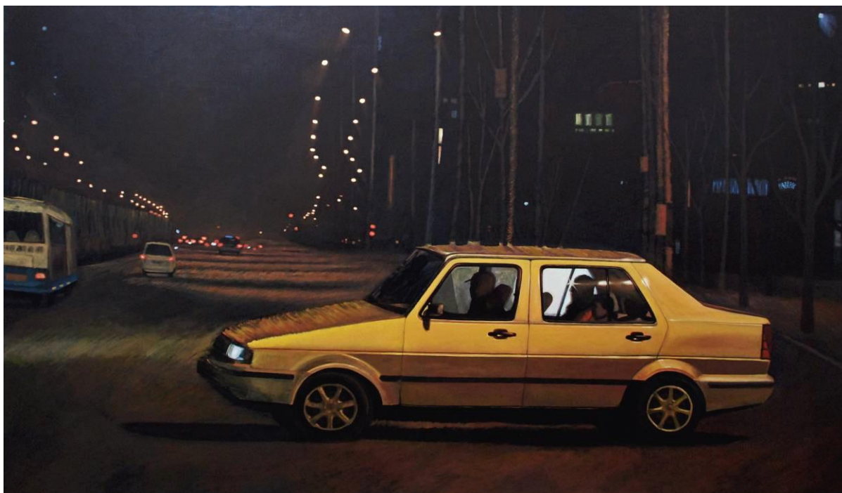
我们要下车 We Want To Get Off 2011