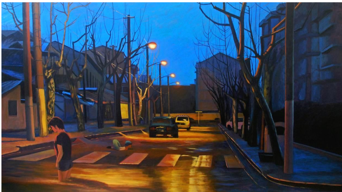
细雨 Fine Rain 2012