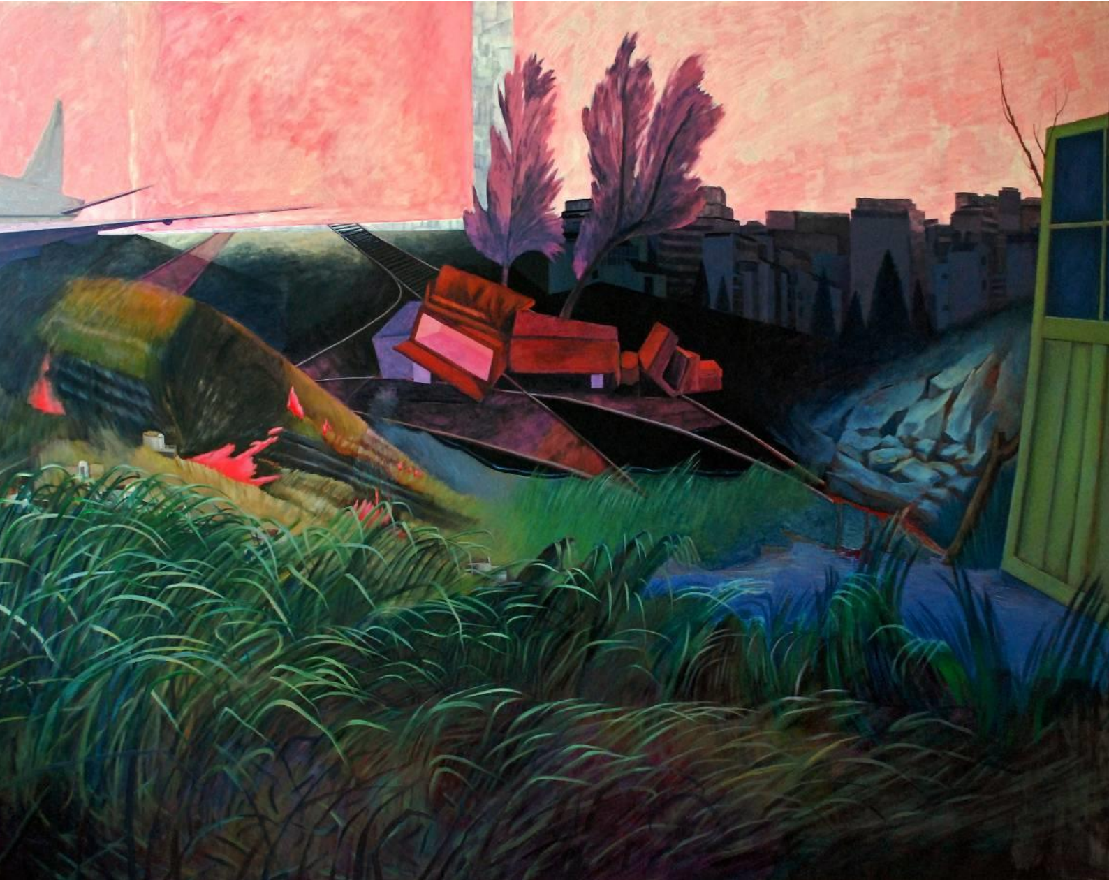
失去象征的世界 Loss of a Symbol of the World 2012