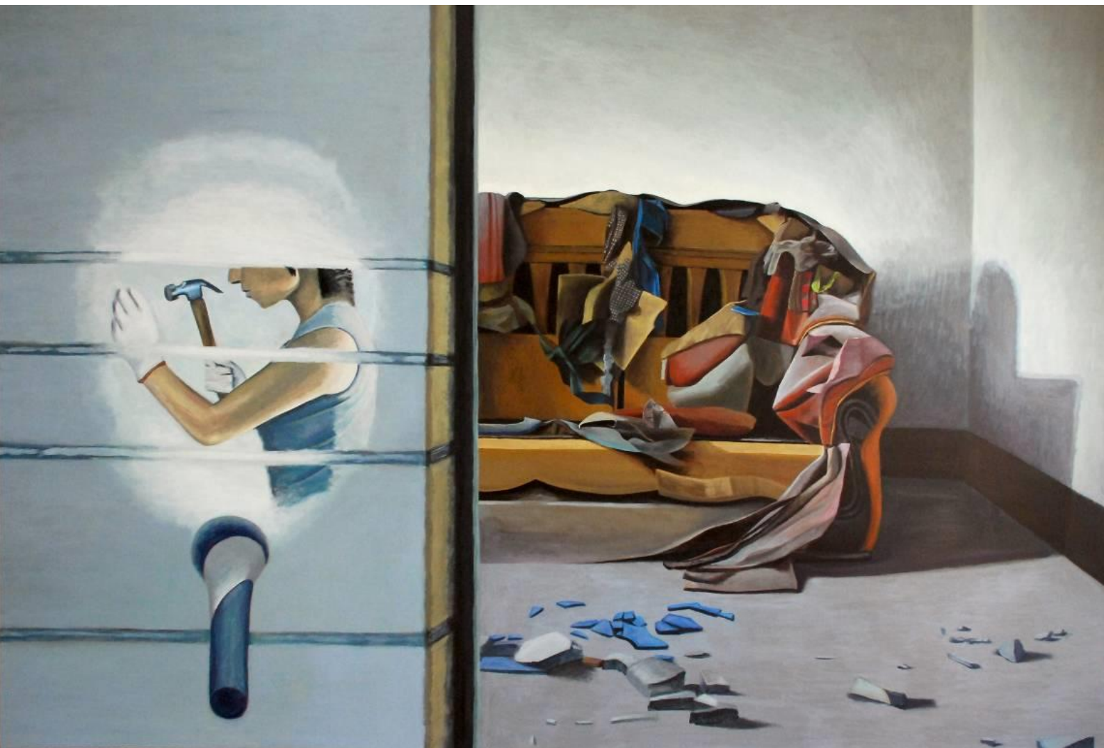
漂移 Drift 2013