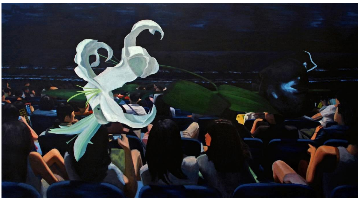
月晷 The Moon Dial 2012