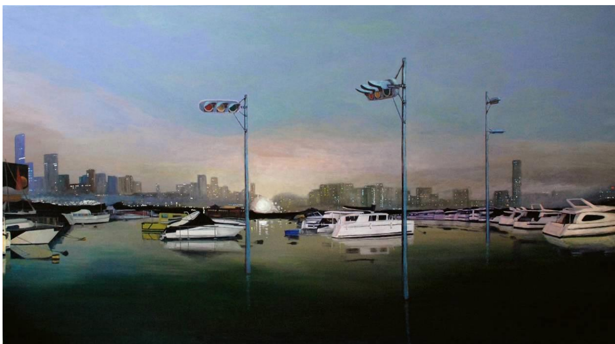
人造沙滩 Artificial Beach 2011