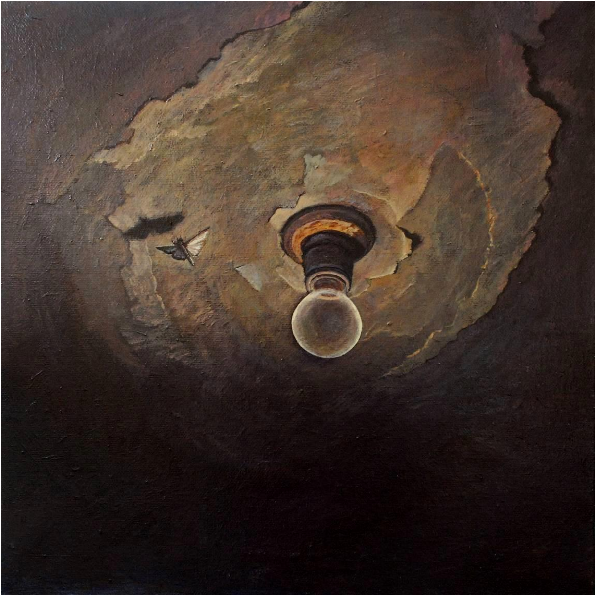
请为我们谈信任 Please Talk About Trust For Us 2011