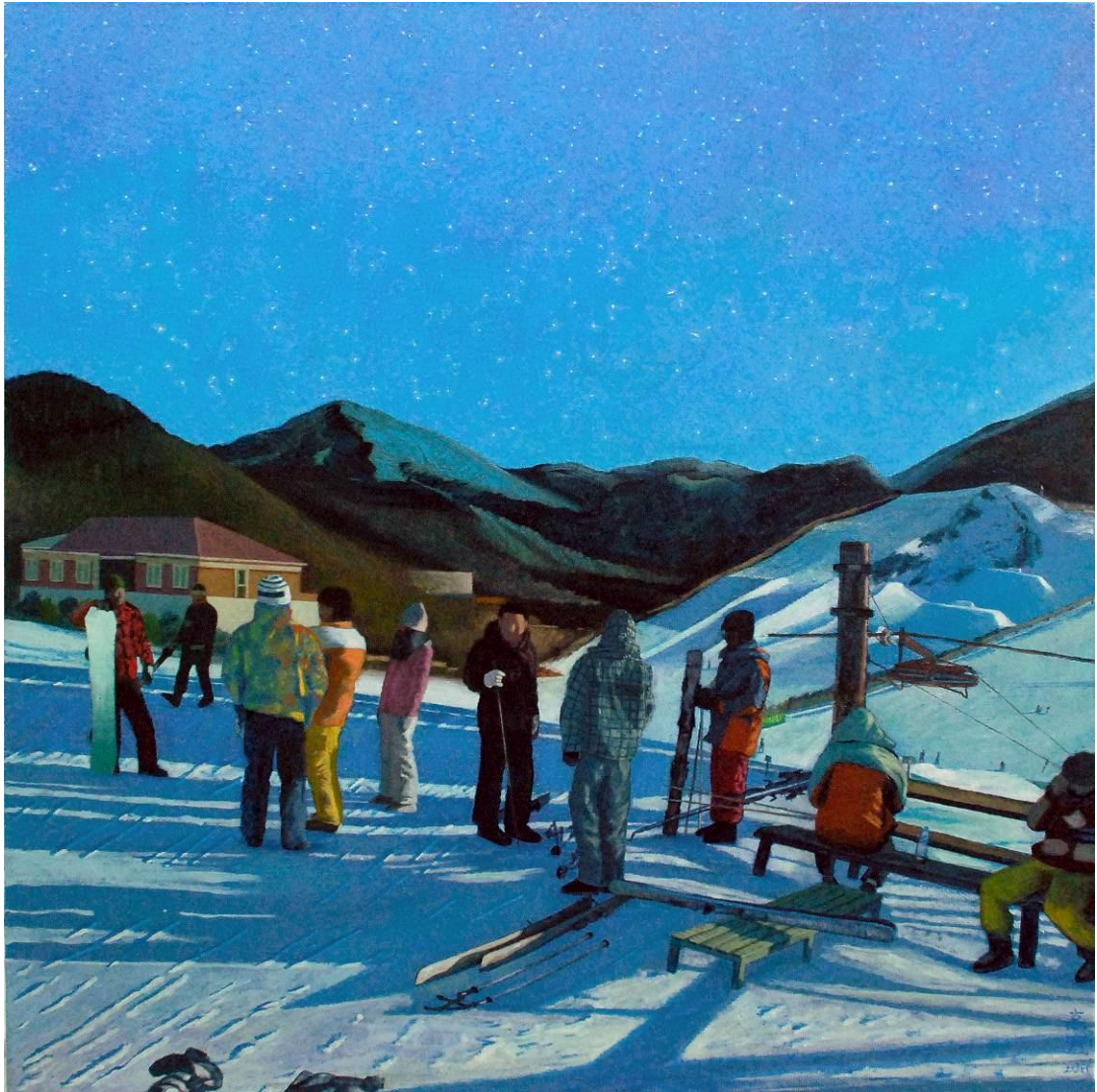
瑕疵 Defect 2011