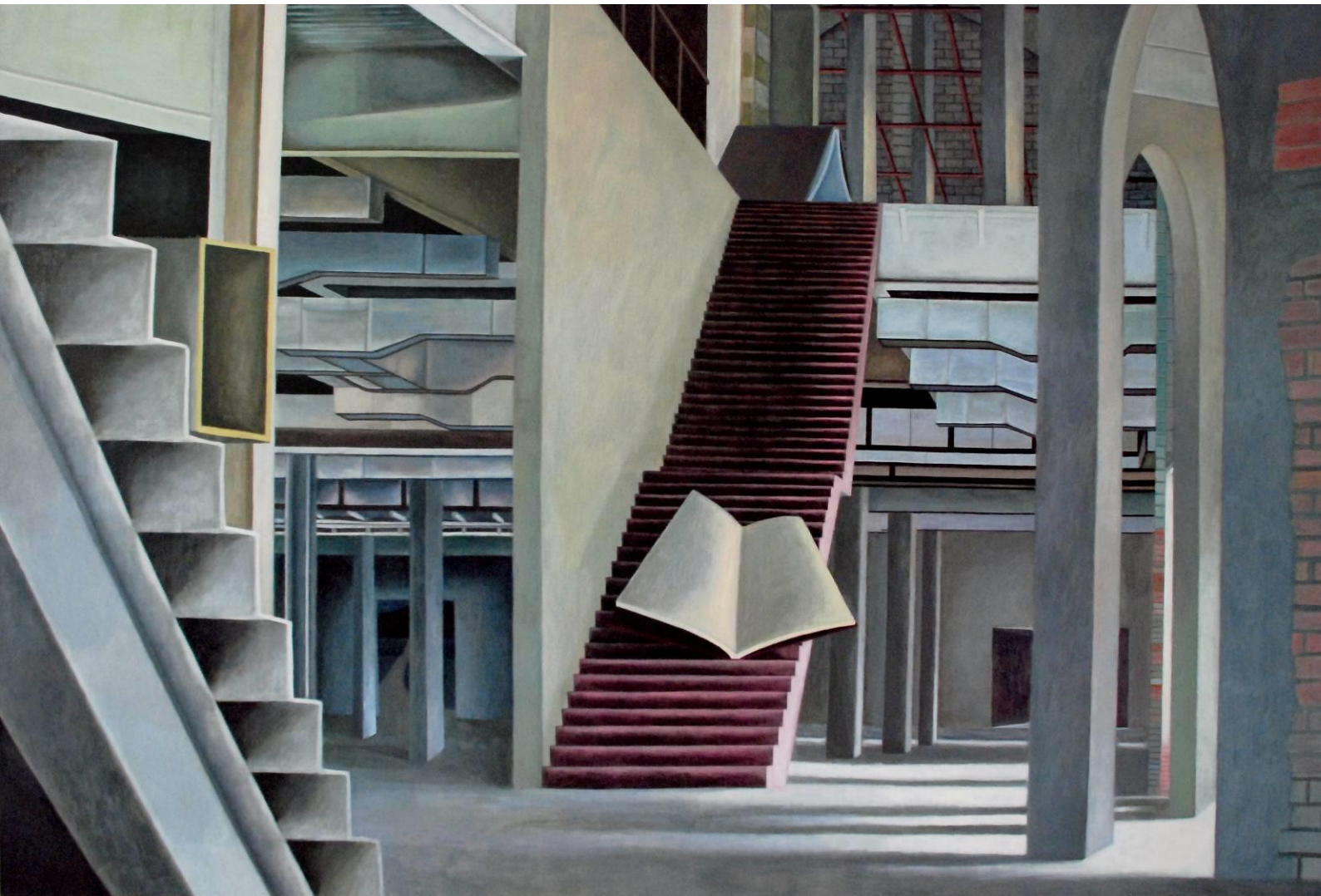
事象地平线 Event Horizon 2014