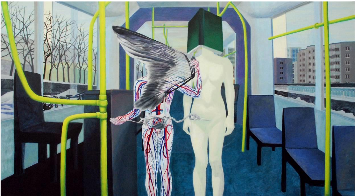
圈套和线索 Snare and Clues 2012