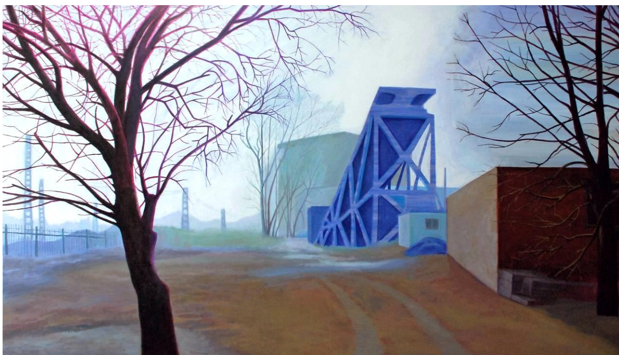
出路 Way Out 2012