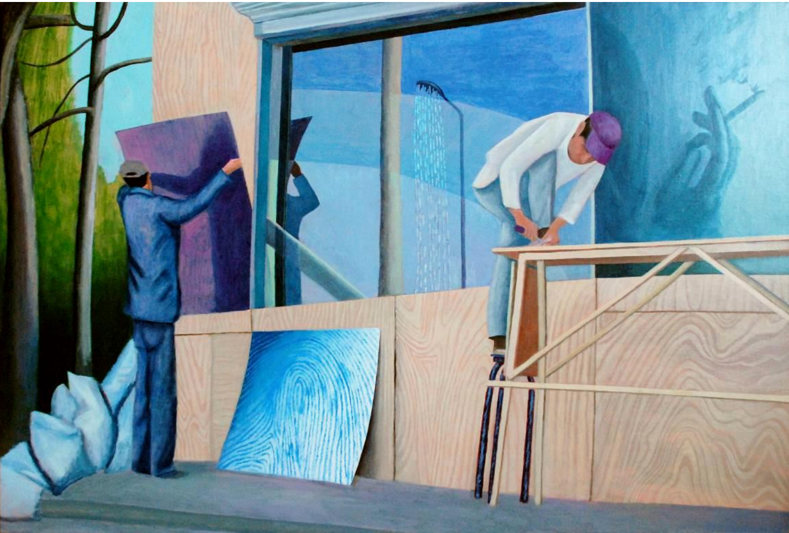
绵延 Stretch 2013