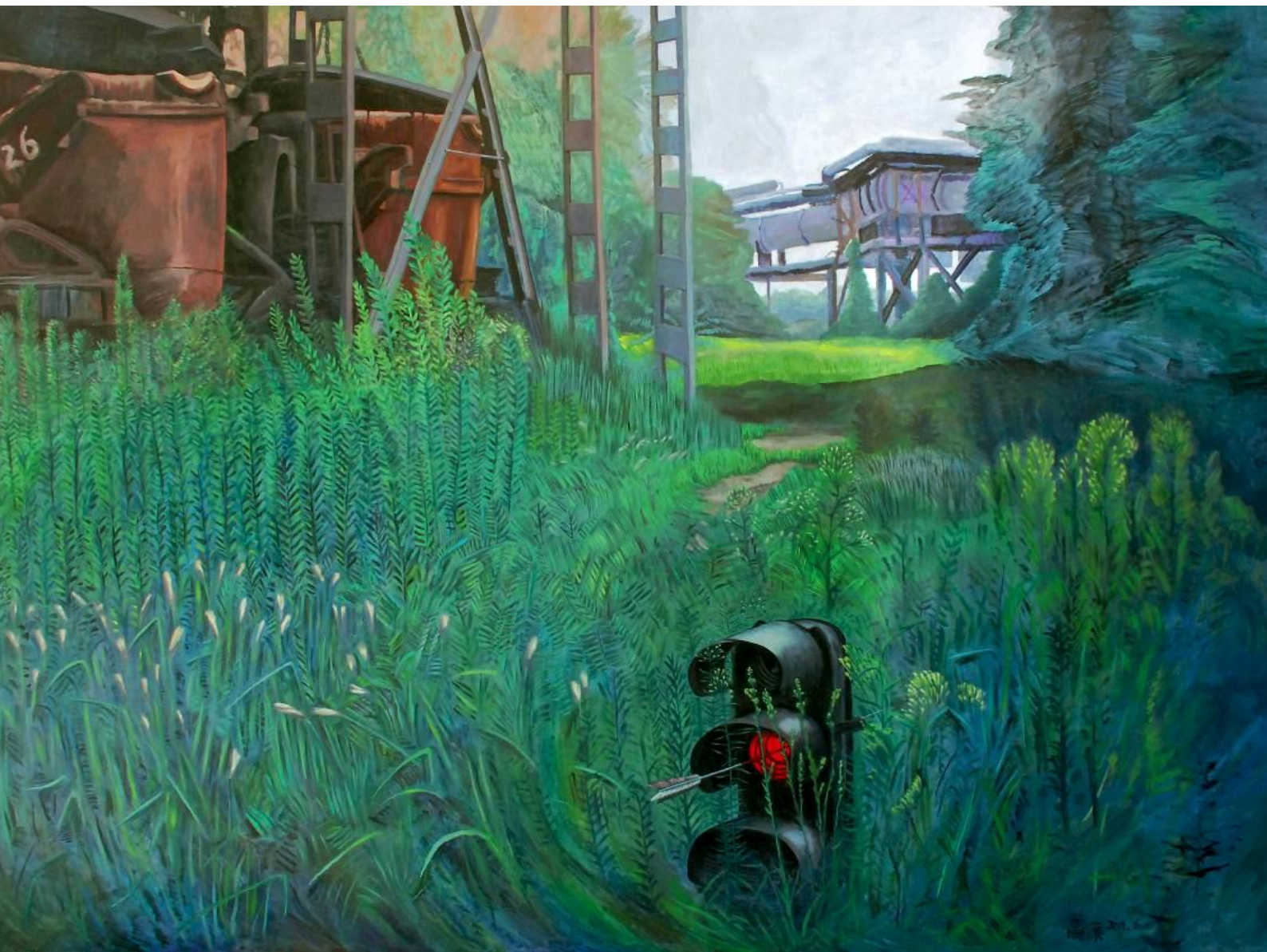
致敬心之一击 Pay Tribute to the Heart of One of the Strike 2011