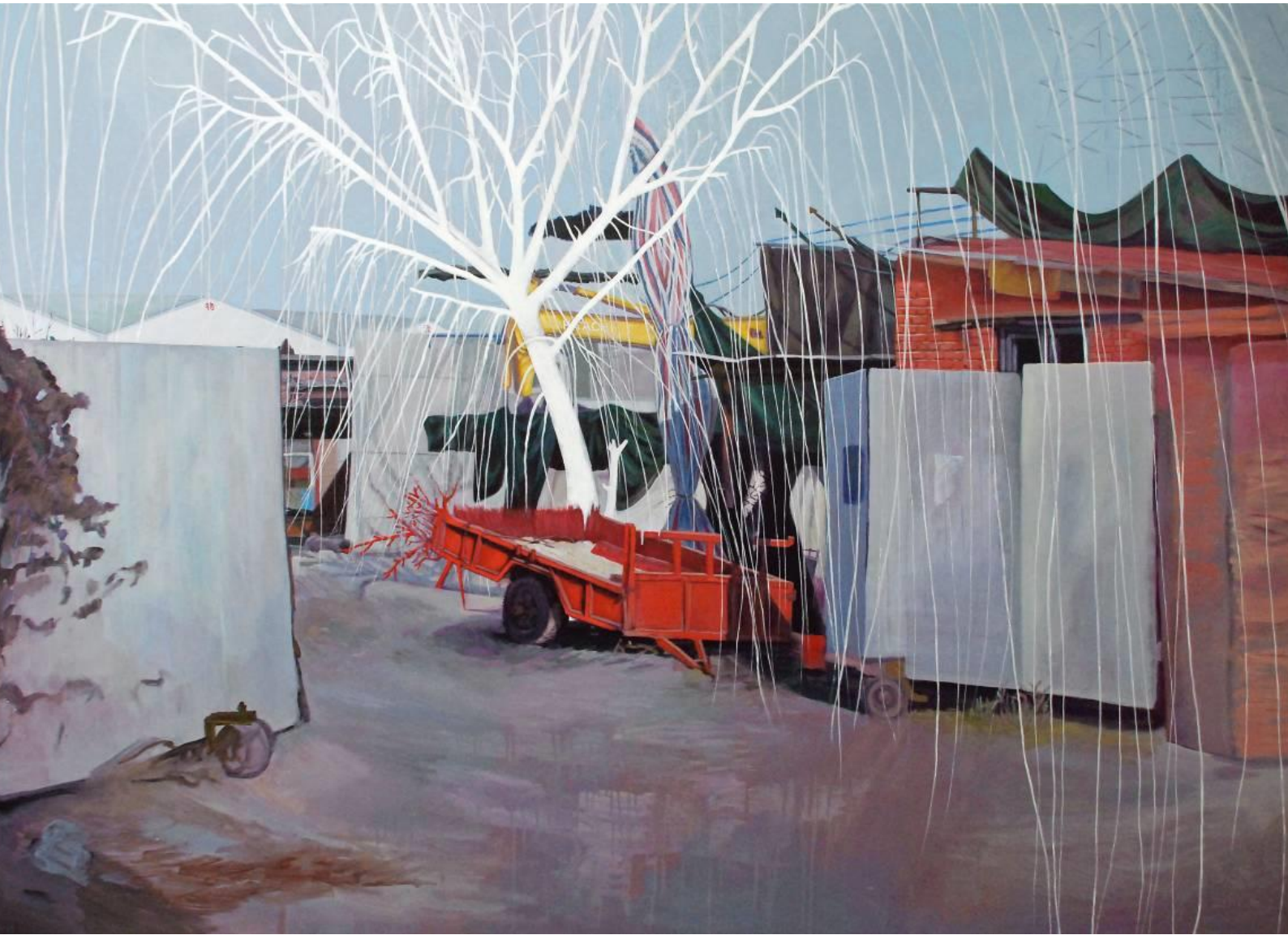
“绝对不可以自杀” “Definitely Do Not Commit Suicide”