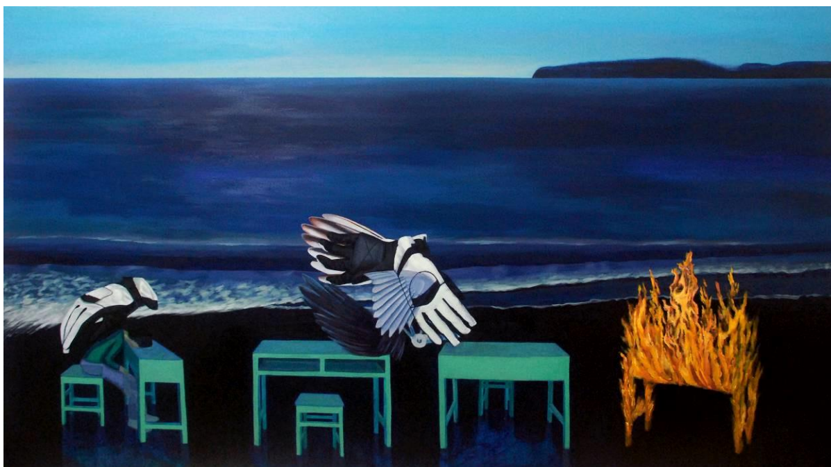
安慰 Comfort 2012